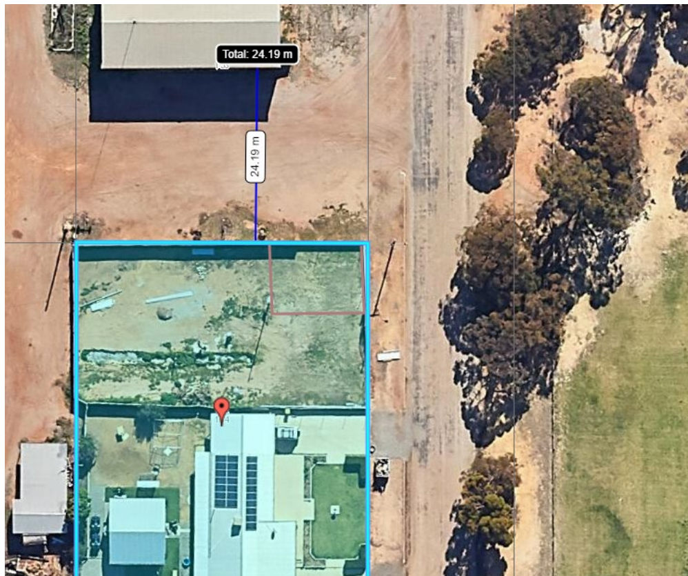
Figure 3 Site location