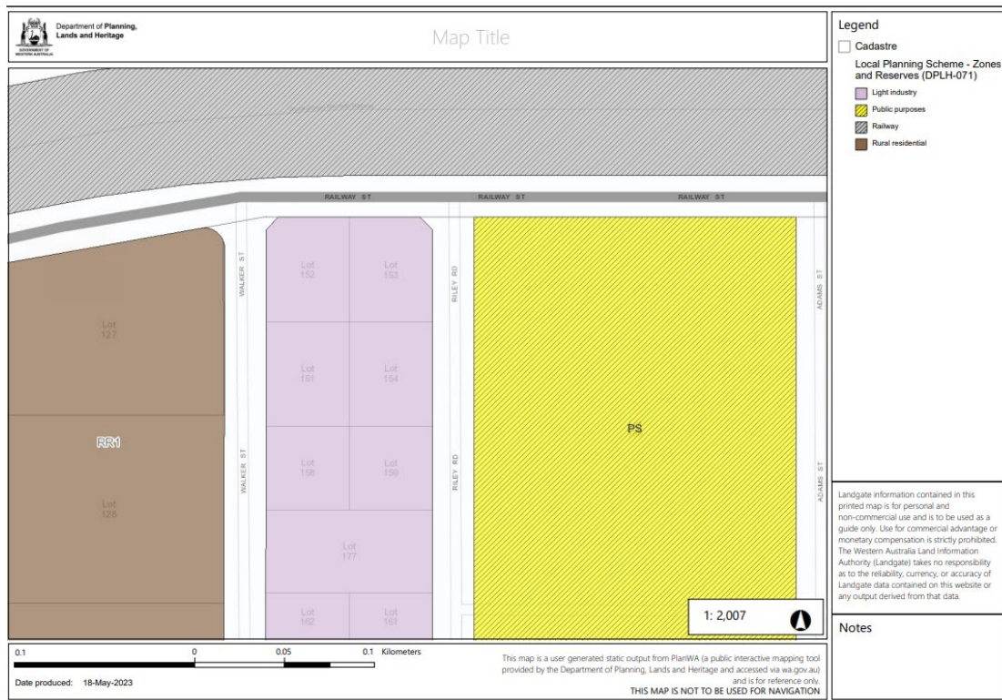
Figure 1 Subject site Zone